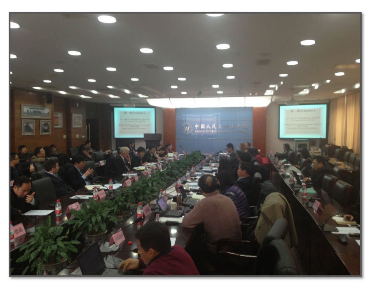
U.S.-China IP Cooperation Dialogue in action at Renmin University in Beijing, China January 2013