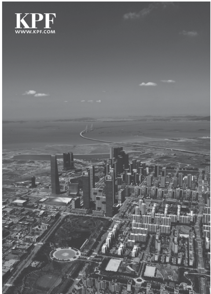
SONGDO INTERNATIONAL BUSINESS DISTRICT, INCHEON KOREA